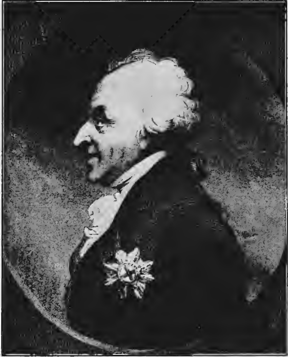
WILLIAM, FOURTH DUKE OF QUEENSBERRY.